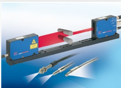
Optical micrometers and fiber optics, measuring and test amplifiers